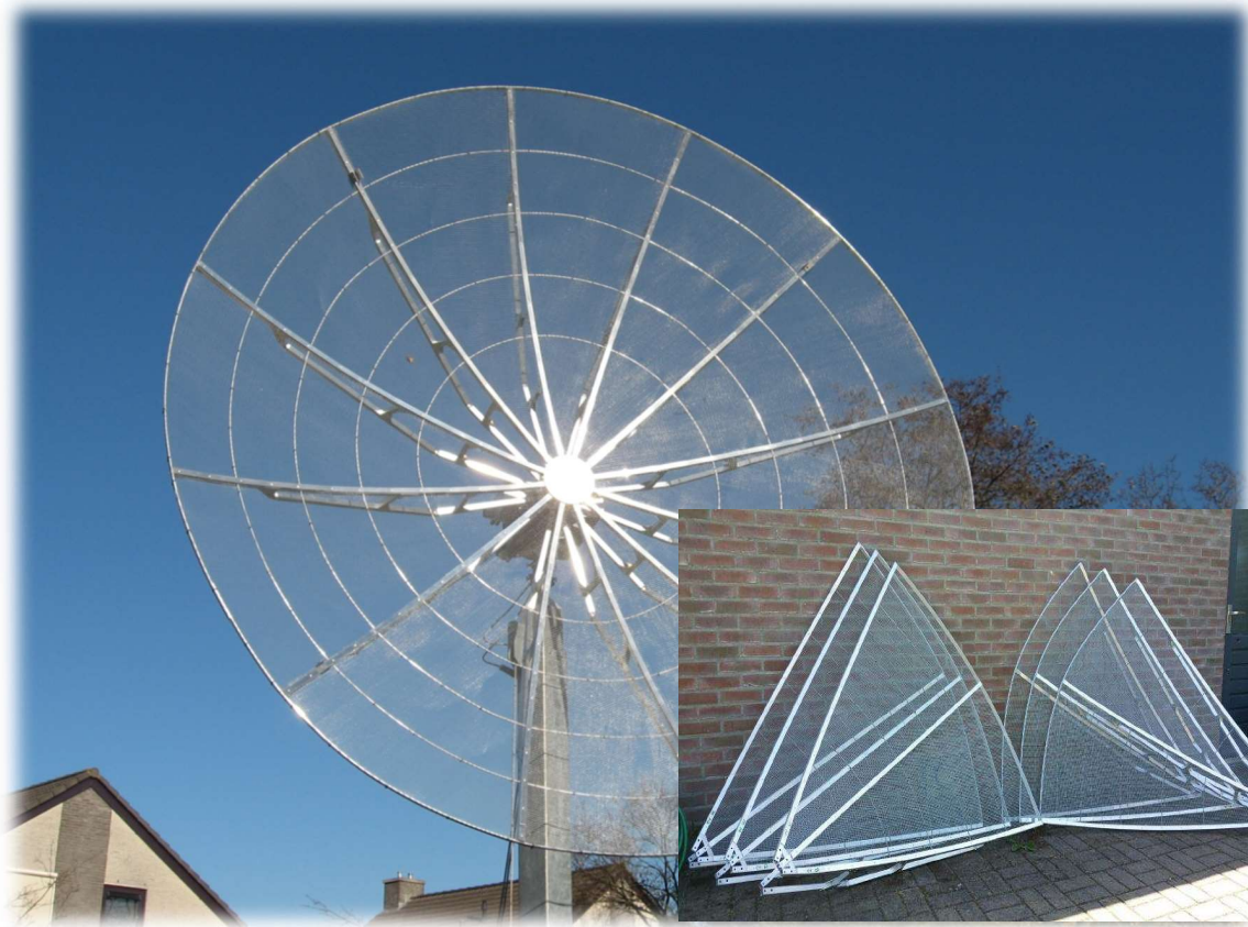
3 meter DISH KIT

Available F/D: 0.45 (P/N: FPD 3M0 KIT/6P)